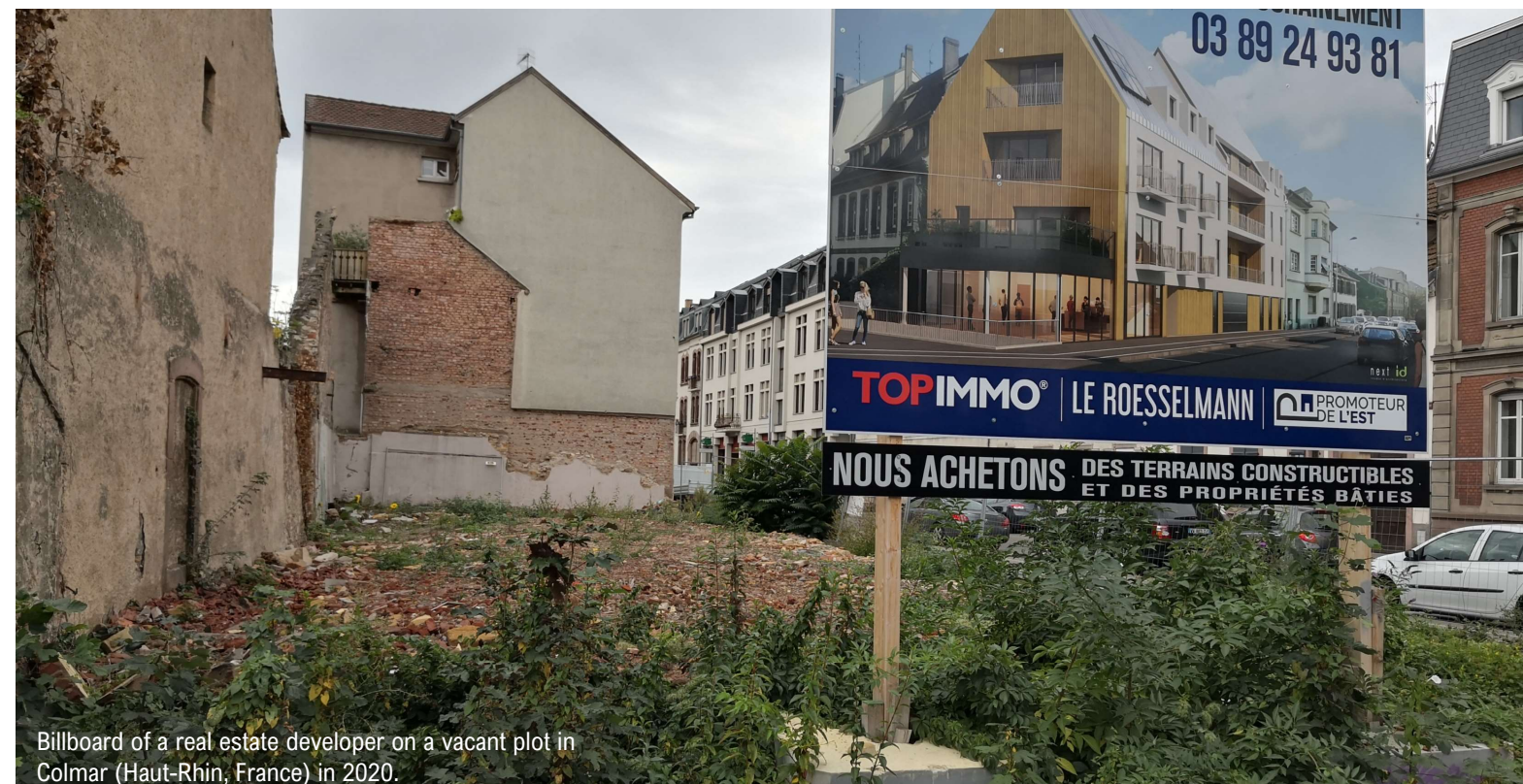
Billboard of a real estate developer on a vacant plot in Colmar (Haut-Rhin, France) in 2020.

Vélib' Station Place du Front Populaire - George Sand